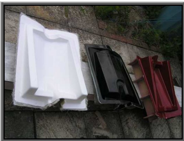
Above: Engine mount moulding. The red moulding is the plug, the black moulding is the mould and the white one is the first off production moulding.