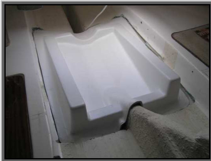
Above: The engine bed moulding in place looking aft inside the hull. This has been recessed into the floor and epoxy bonded to the hull behind the centre plate casing.