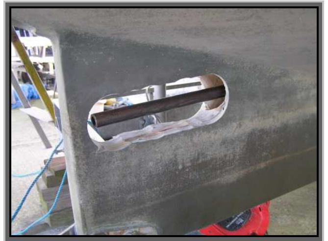
Above: The engine propeller shaft in its approximate position. This has been achieved at only 6 degrees from the horizontal