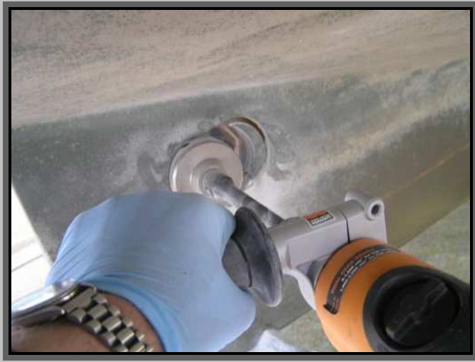
Above: Not for the faint hearted! Cutting through the keel for installation of the propeller shaft stern tube.