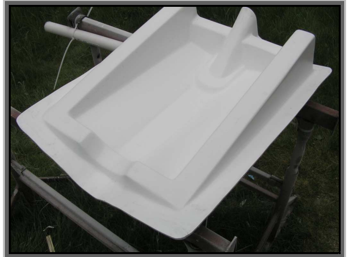
Above: The first production moulding