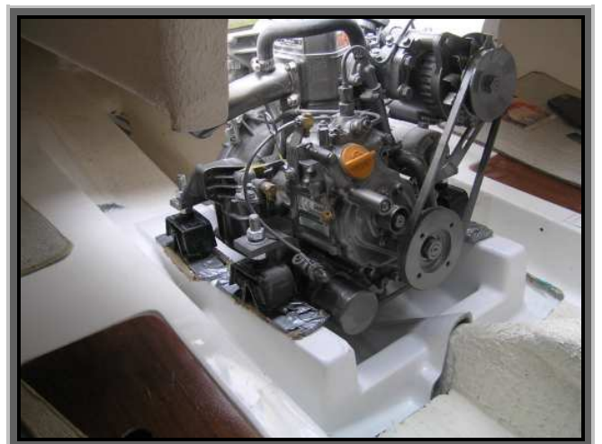
Above: The first trial fit of the engine with flexible mount supports which will reduce vibration to the hull.